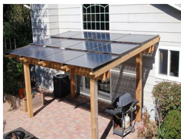
Read This Before Going Solar in California (It's Genius) UNDERSTAND SOLAR