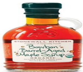
Organic Bourbon Barrel-Aged Maple Syrup STONEWALL KITCHEN